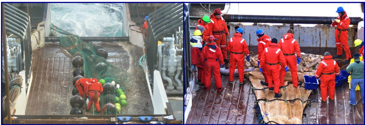
Fig. 1. Recovering the rough bottom trawl

The weather as expected has already had an impact. From a relatively calm sea we suddenly experienced a 3-4m swell coming from the south but no significant wind. The assumption, “it must be blowing very hard to the south of the ship”. Half an hour later the wind arrived and blew at 50 knots for over 12 hours with up to 8m swells causing the cessation of all over-the-side activities.