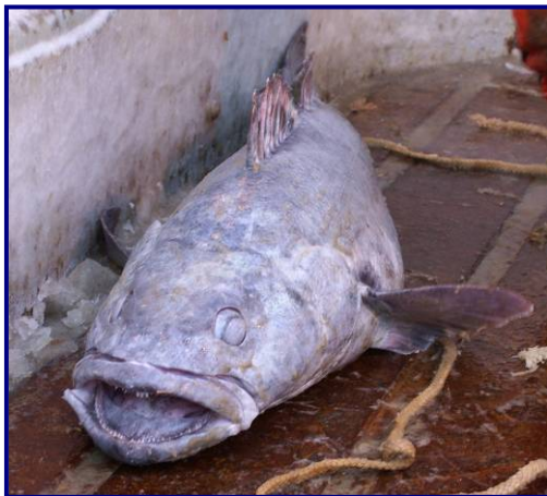
Fig. 6. Antarctic Toothfish

A small benthic invertebrate trawl (Little BIT) has been deployed with the rough bottom trawl at some stations and has proved very successful with some good additional benthic samples coming from it.