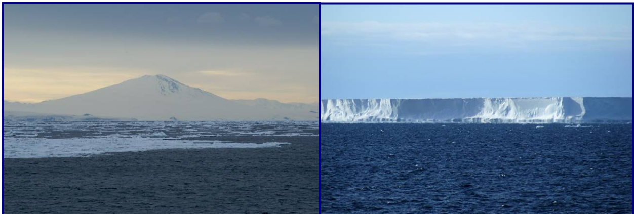
Fig. 3. Mt Melbourne (2733m) backdrop to Terra Nova Bay

Once the first station was completed, with ten successful different gear deployments, the ship headed to the next station near to Terra Nova Bay. This was the first and possibly the last chance to see views of the Antarctic mainland on this trip, along with the 24nm long iceberg (B15J) possibly grounded off the coast. A sunny day also helped after a week of grey skies and regular falls of snow.