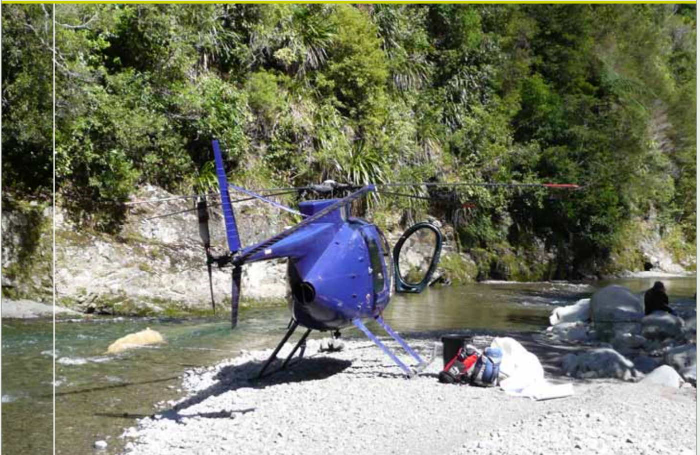
Surveying eels in the Motu River.